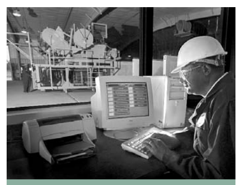
The superintendent of Goldsboro's new compost facility oversees operations in the control room. A compost agitator is in the background.

At the completion of the composting process, a heavy-duty loader moves the compost material from the back end of the compost bays